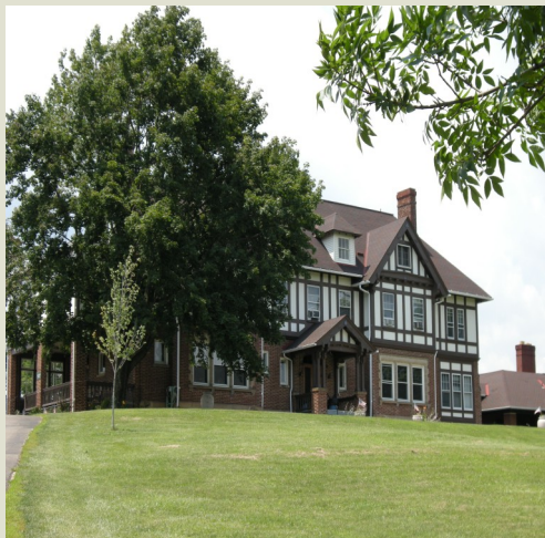
Mars Home for Youth campus

As we head into the end of the school year, MHY continues to look for resources to meet the needs of our region's most vulnerable youth.