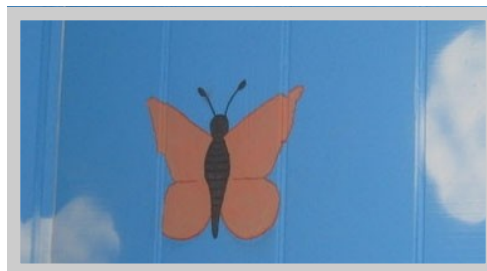
Artwork on Residence Halls