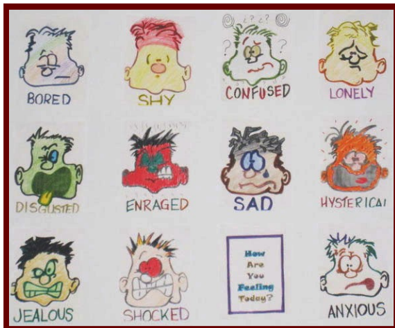
Some of the emotions we all feel every day